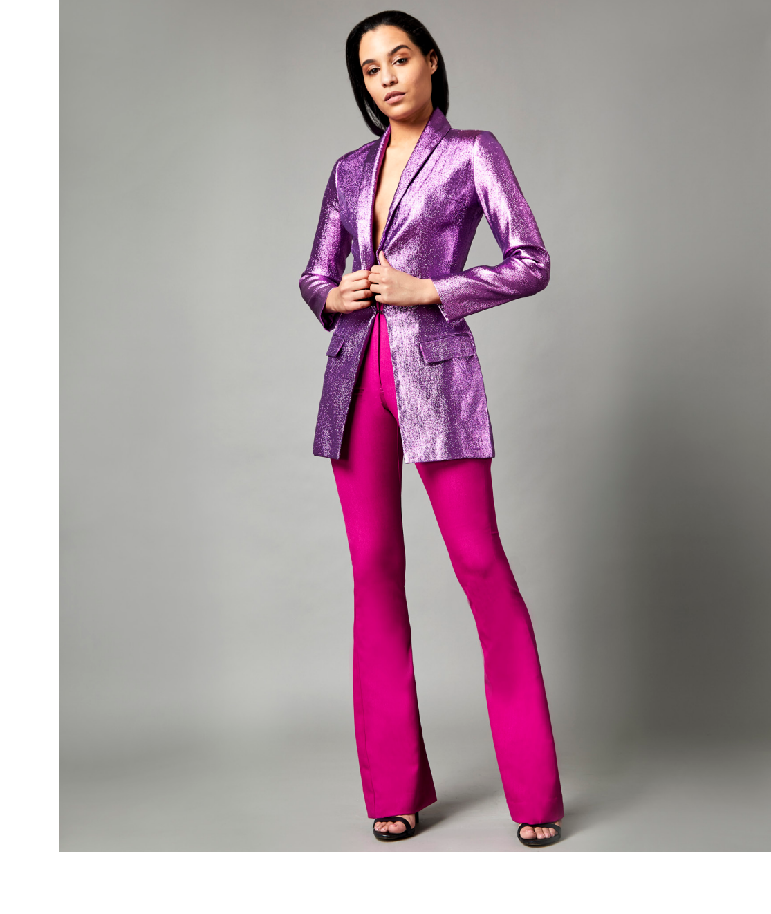
West Indies High Waist Pant Magenta Gabardine Sizes 2-14