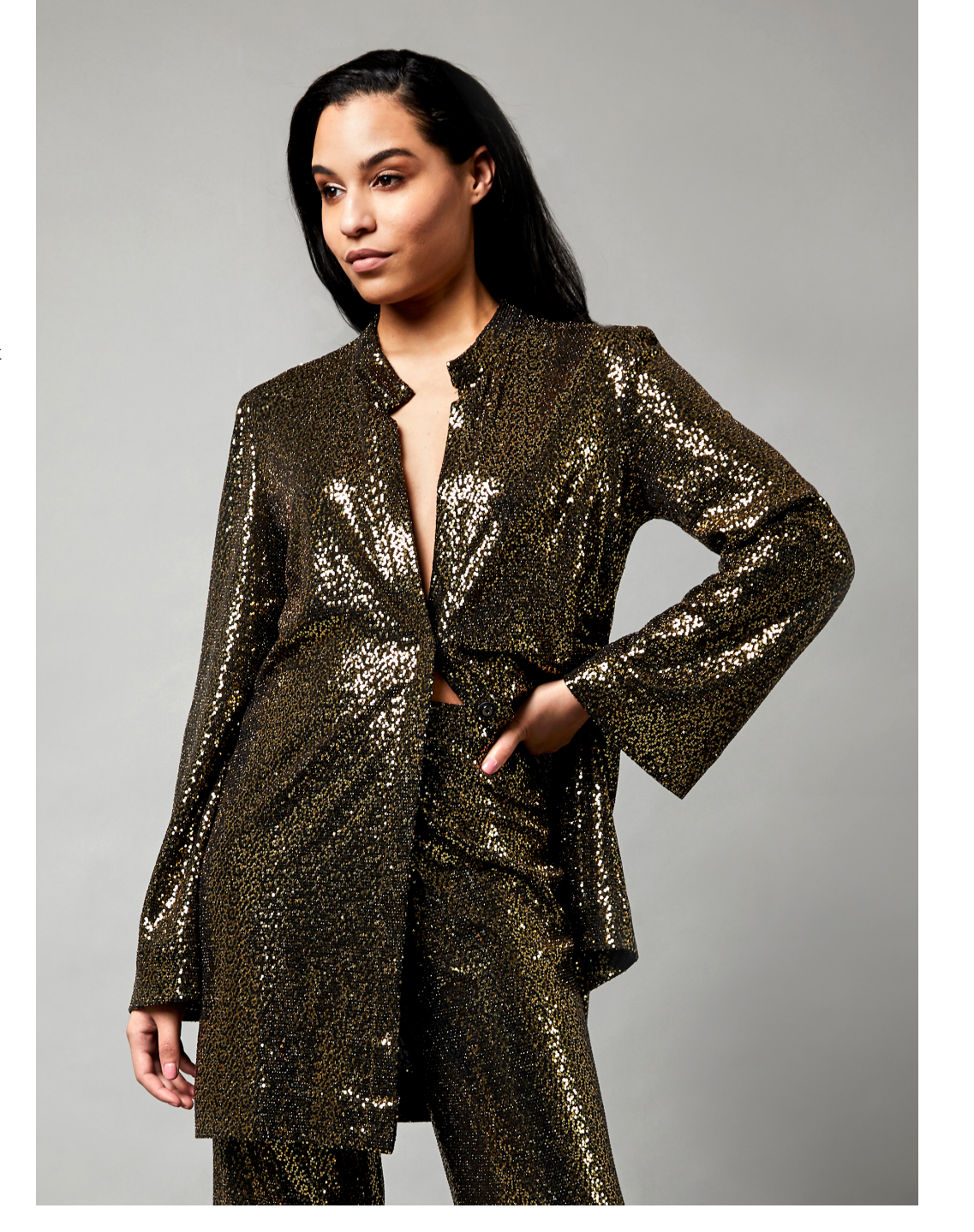
Guardian Blouse 87% Nylon / 8% Metallic / 5% Spandex Stretch knit with Sequin Size S / M / L / XL