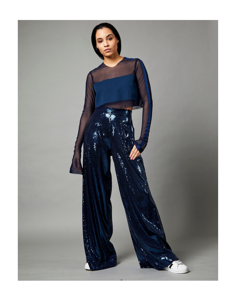
Hollywood High Waist Pant Navy Sequin Sizes 2-14